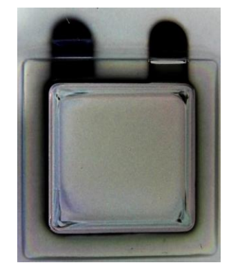
Figure 2: Photographic picture of 250 µAh Stereax M250 solid state battery.