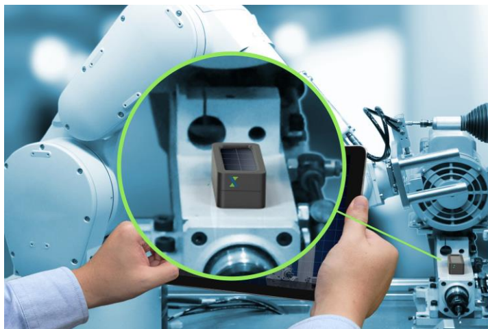
Example of perpetual beacon use case