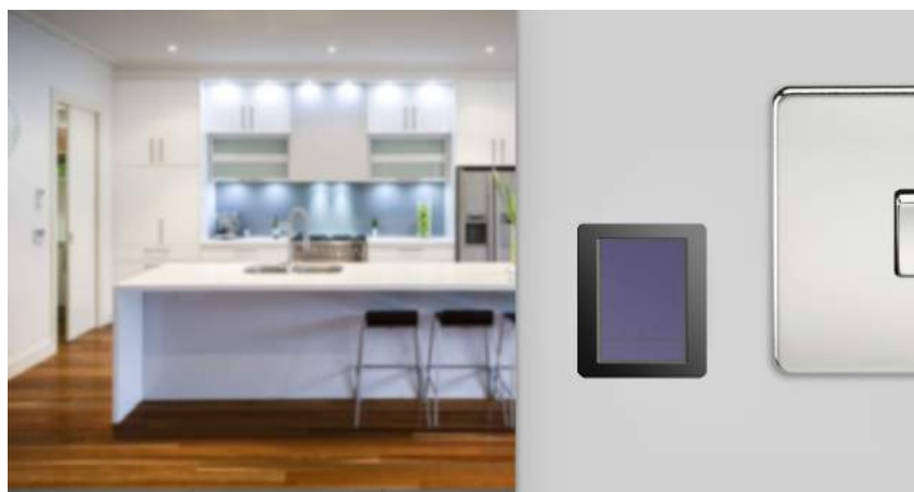
The Perpetual Beacon can be placed and forgotten on the wall of a Smart Home