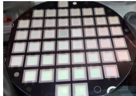
Stereax P180 solid state batteries deposited on 6" wafer