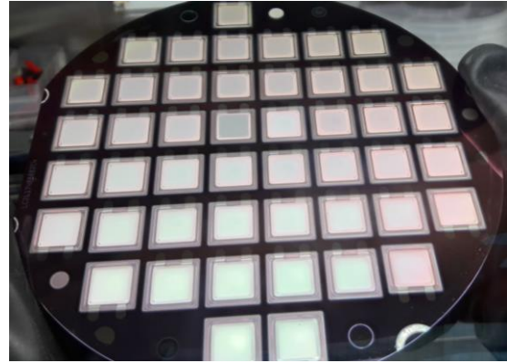
Stereax P180 solid state batteries deposited on 6" wafer