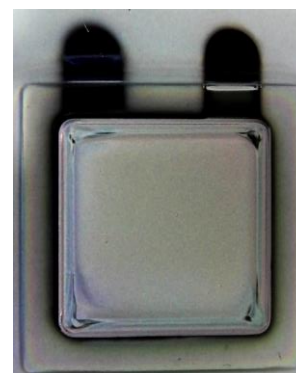
Figure 2: Photographic picture of 250 μAh Stereax M250 solid state battery.