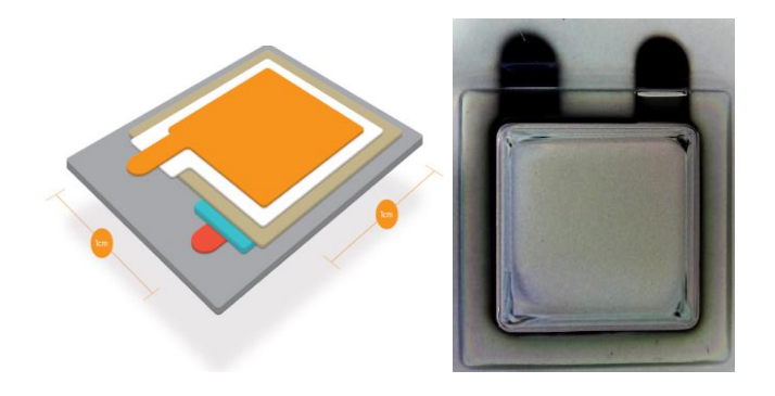
Figure 1: Graphic representation and photographic picture of 250 µAh Stereax solid state battery.