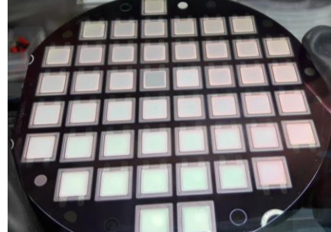
Stereax P180 solid state batteries deposited on 6" wafer